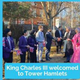
King Charles III welcomed to Tower Hamlets