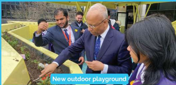
New outdoor playground