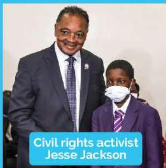
Civil rights activist Jesse Jackson