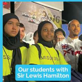
Our students with Sir Lewis Hamilton