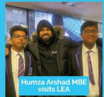
Humza Arshad MBE visits LEA