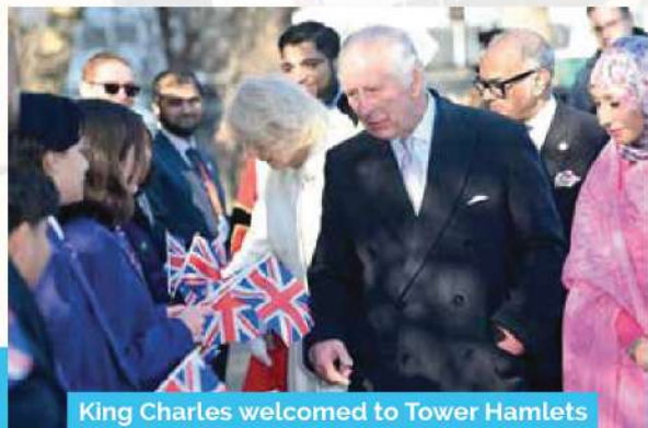
King Charles welcomed to Tower Hamlets