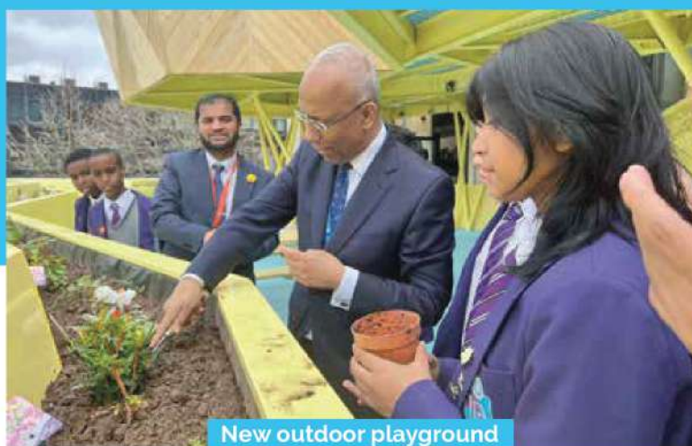
New outdoor playground

"The teachers never failed to keep the students motivated all the time" - Year 11 parents