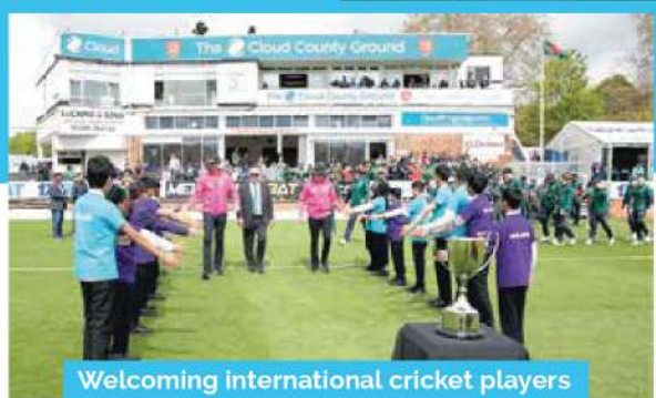
Welcoming international cricket players